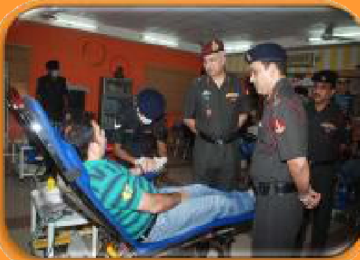
Blood Donation-The Greatest Gift of life