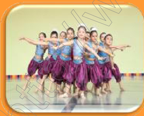
Little Salwanians enchant the esteemed audience with 'Ganesh Vandana'.