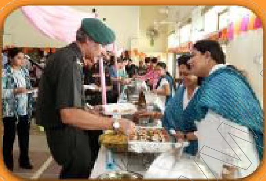
Food Festival -flavours of rich Indian cuisines.