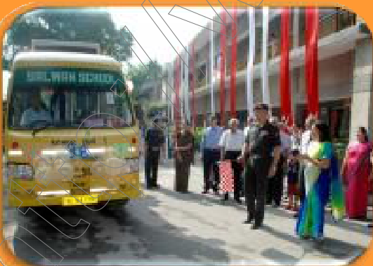
Flagging off the bus going to hospital with gifts