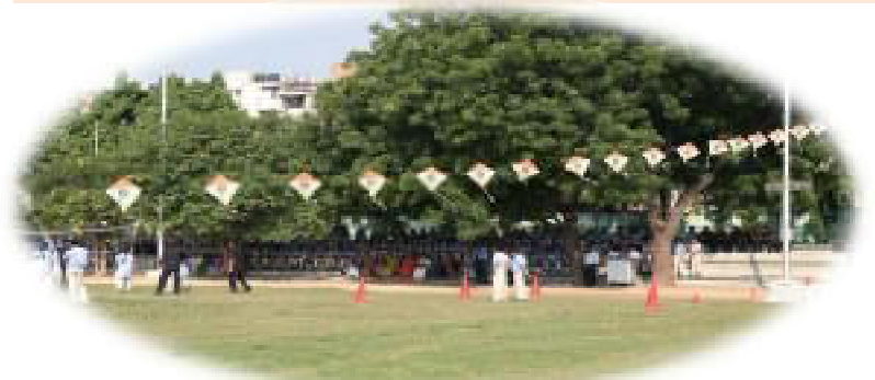
Colour of Patriotism

The students entertained the gathering through a cultural programme and Buddy Games between soldiers and parents. Kite flying added fun to the magnificent occasion. An amazing spectacle was witnessed by the guests, when an artist from Rampur decorated the sky with 100 kites on a single string.